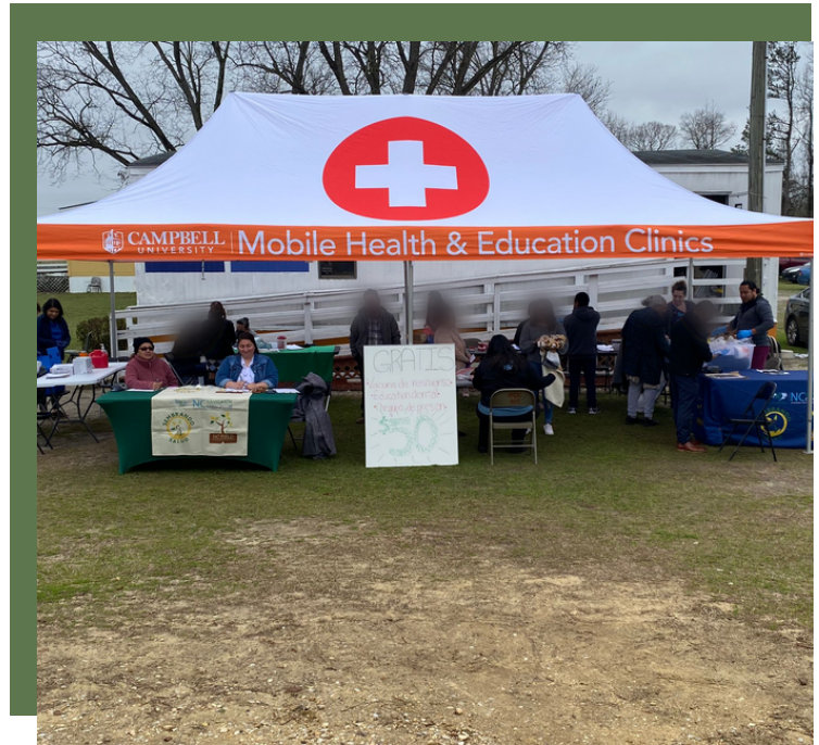
Throughout the pandemic NC FIELD was able to streamline access that provided over 3000 COVID-19 vaccines to people in rural ENC