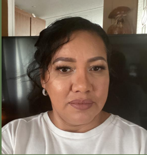
Community Health Worker Case Manager